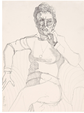
Mary Garrard, 1977 Ink and graphite on paper 76.5 x 57.1 cm 30 1/8 x 22 1/2 in