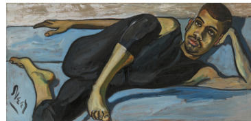
Ballet Dancer , 1950 Oil on canvas 51.1 x 107 cm 20 1/8 x 42 1/8 in