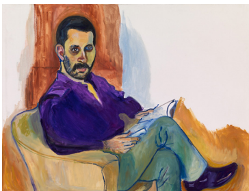
Brian Buczak , 1983 Oil on canvas 91.4 x 121.9 cm 36 x 48 in