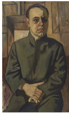
Paul Küyer, 1959 Oil on canvas 91.4 x 55.9 cm 36 x 22 in