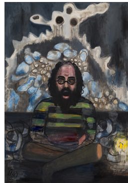
Allen Ginsberg , 1966 Oil on canvas 127 x 89.5 cm 50 x 35 1/4 in