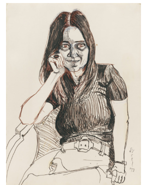
Adrienne Rich, 1973 Ink on paper 75.6 x 55.9 cm 29 3/4 x 22 in