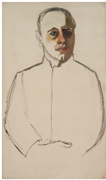
Paul Küyer, 1959 Oil on canvas 86.4 x 51.1 cm 34 x 20 1/8 in