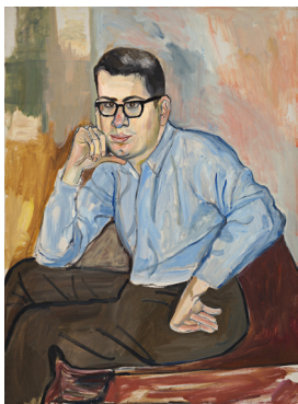
Richard Gibbs' Friend, 1962 Oil on canvas 106.7 x 78.7 cm 42 x 31 in