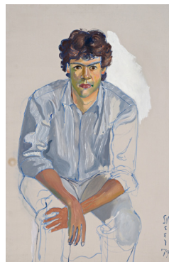
John Cheim, 1979 Oil on canvas 115.6 x 76.2 cm 45 1/2 x 30 in