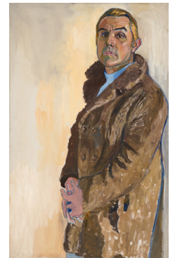
Kris Kirsten , 1971 Oil on canvas 121.6 x 76.2 cm 47 7/8 x 30 in