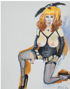
Annie Sprinkle , 1982 Oil on canvas 154.6 x 112.1 cm 60 7/8 x 44 1/8 in