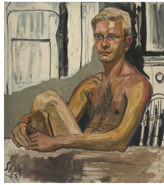
Richard Gibbs, 1965 Oil on canvas 96.5 x 86.4 cm 38 x 34 in