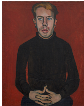
Martin Jay , 1982 Oil on canvas 63.5 x 51.4 cm 25 x 20 1/4 in