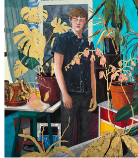
Conceptual Artist #5 (A budding gilder, his dying houseplants get the Midas touch) , 2022 Acrylic and genuine gold leaf on linen 183.5 x 152.7 cm 72 1/4 x 60 1/8 in