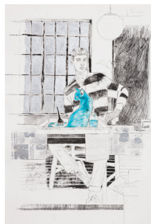
Conceptual Artist #7 (A Warhol enthusiast, his 26th studio mate completes the story) , 2022 Ink transfer, dry brush, silkscreen, 'liquid Metallic Silver' paint, and Dr. Ph. Martin's Concentrated Water Color on paper 189 x 130.8 cm 74 3/8 x 51 1/2 in