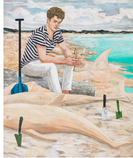
Conceptual Artist #10 (A sand sculptor and environmentalist, he exclusively carves scenes of mass 'beachings') , 2022 Acrylic, glass beads and natural sand on linen 183.5 x 152.7 cm 72 1/4 x 60 1/8 in