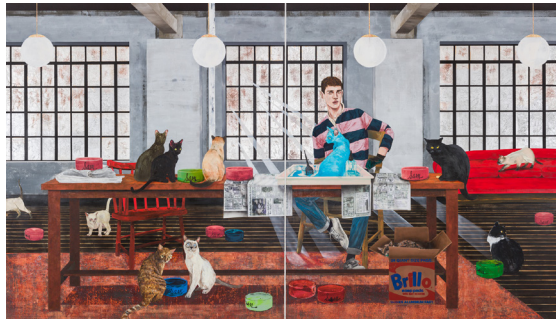
Conceptual Artist #7 (A Warhol enthusiast, his 26th studio mate completes the story), 2022 Acrylic, genuine silver and metal leaf, ink transfer, silkscreen, and Dr. Ph. Martin's Radiant Concentrated Water Color on linen Diptych, each panel: 243.8 x 213.4 cm 96 x 84 in