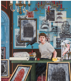
Conceptual Artist #6 (By combining different grave rubbings he invents lives that never existed), 2022 Acrylic and silkscreen on linen 243.8 x 213.4 cm 96 x 84 in