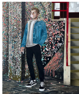
Conceptual Artist #3 (Chewing gum every waking hour of the day, he considers 'Bubblegum Alley' his archive), 2022 Acrylic on linen 183.5 x 152.7 cm 72 1/4 x 60 1/8 in