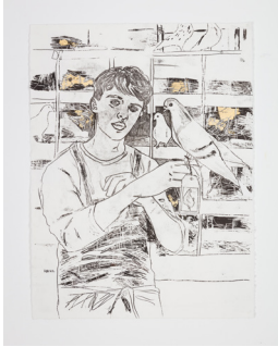
A pigeon portraitist, his subjects are trained to deliver the work themselves , 2022 Ink and gold leaf transfer on paper 76.3 x 57.4 cm 30 x 22 5/8 in