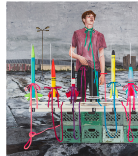
Conceptual Artist #9 (Performance based, his work is tied to the binds of gravity), 2022 Acrylic on linen 243.8 x 213.4 cm 96 x 84 in