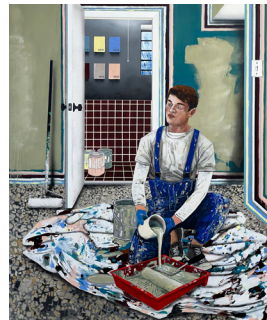
Conceptual Artist #4 (Objectively neutral, each January he re-paints the walls of his studio an official 'Colour of the Year') , 2022 Acrylic on linen 183.5 x 152.7 cm 72 1/4 x 60 1/8 in