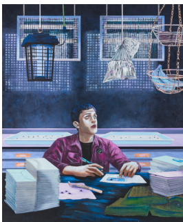
Conceptual Artist #13 (Founder and sole member of the BUZZ OFF INITIATIVE, he spends his nights mailing everyone in his zip code a single dead fly) , 2022 Acrylic on linen 183.5 x 152.7 cm 72 1/4 x 60 1/8 in