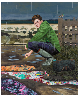
Conceptual Artist #8 (Land-based and intentionally ephemeral, his work aided by a trusted bag of food colouring elevates rural puddles), 2022 Acrylic on linen 183.5 x 152.7 cm 72 1/4 x 60 1/8 in