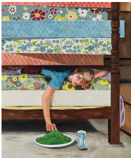
Conceptual Artist #11 (Performance based, his work centres on discomfort) , 2022 Acrylic on linen 183.5 x 152.7 cm 72 1/4 x 60 1/8 in