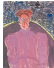
Avery Feeling Wild , 1963 Oil on board 71.1 x 55.9 cm 28 x 22 in