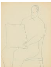
Untitled , n.d. Ink on paper 27.9 x 21.6 cm 11 x 8 1/2 in