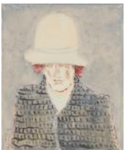
New Hat , 1962 Oil on board 76.2 x 61 cm 30 x 24 in