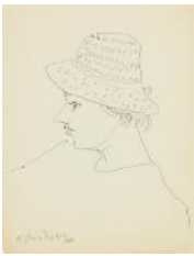
Joy , 1960 Ink on paper 27.9 x 21.6 cm 11 x 8 1/2 in