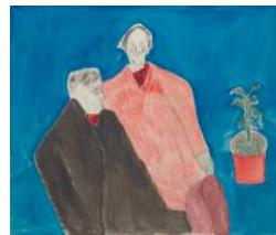
Two Poets , 1963 Oil on canvas 127 x 152.4 cm 50 x 60 in