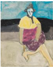
Sally by the Sea , 1962 Oil on board 76.2 x 61 cm 30 x 24 in