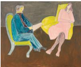
Young Couple (Husband and Wife) , 1963 Oil on canvas 127 x 152.4 cm 50 x 60 in