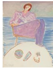
Lavender Girl , 1963 Oil on canvasboard 76.2 x 61 cm 30 x 24 in