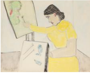
Artist Paints Artist , 1962 Oil on board 61 x 91.4 cm 24 x 36 in