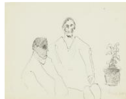
Study for 'Two Poets' , 1963 Ink on paper 21.6 x 27.9 cm 8 1/2 x 11 in