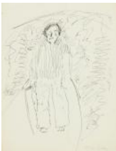
Untitled (Study for 'Milton Avery') , c. 1961 Ink on paper 29.7 x 21.6 cm 11 3/4 x 8 1/2 in