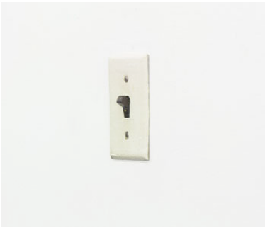
Jordan Wolfson TBC, 2007 light switch (JW 01)