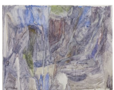
Varda Caivano Untitled, 2010 Oil on Canvas 84 x 107.8 cm, 33 1/8 x 42 1/2 in