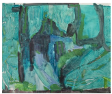
Varda Caivano Untitled, 2010 Oil on Canvas 93 x 112.5 cm, 36 5/8 x 44 1/4 in