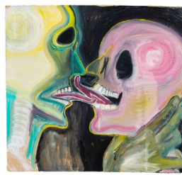
Love Means Never Having to Say You're Ugly, The Kiss , 2015 Oil on cardboard 36.6 x 33.4 cm 14 3/8 x 13 1/8 in