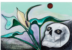
Flowers of Evil, Parson in the Pulpit , 2014 Oil on card 40 x 68 cm 15 3/4 x 26 3/4 in