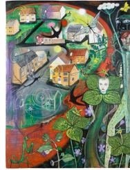
Flowers of Evil, The Nature of Chaos , 2015 Oil on cardboard 107 x 60 cm 42 1/8 x 23 5/8 in