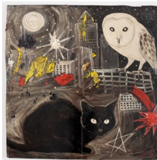
Witchcraft over Docklands , 2013 Oil on cardboard 40 x 39 cm 15 3/4 x 15 3/8 in