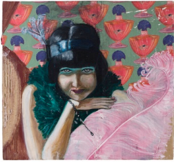
Debbie Shalimar as a Femme Fatale , 2014 Oil on wallpaper on cardboard 45.5 x 48.7 cm 17 7/8 x 19 1/8 in