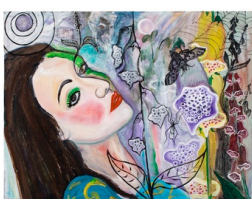
Flowers of Evil, Foxglove Fairy Study , 2015 Oil on card 39 x 50 cm 15 3/8 x 19 3/4 in