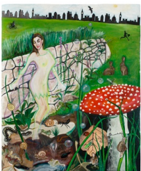
Flowers of Evil, Foxglove Fairy , 2015 Oil on cardboard 90 x 72 cm 35 3/8 x 28 3/8 in