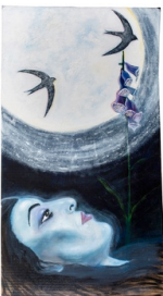
Flowers of Evil, Foxglove Fairy Moonbathing , 2015 Oil on cardboard 93 x 51 cm 36 5/8 x 20 1/8 in