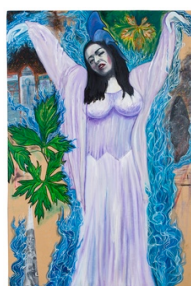
Flowers of Evil, Wolfsbane Fairy with Blue Flames , 2015 Oil on cardboard 110 x 73 cm 43 1/4 x 28 3/4 in