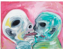
Love Means Never Having to Say You're Ugly, The Kiss, part 2 , 2015 Oil on cardboard 36.5 x 48 cm 14 3/8 x 18 7/8 in