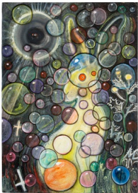
Hare Bubbles , 2011 Oil on paper on board 59.5 x 42 cm 23 3/8 x 16 1/2 in