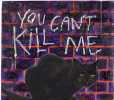
You Can't Kill Me , 2013 Oil on cardboard 40.1 x 35.5 cm 15 3/4 x 14 in