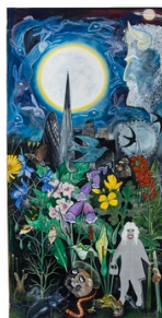
Flowers of Evil, The Congregation , 2015 Oil on cardboard 200 x 103 cm 78 3/4 x 40 1/2 in