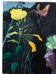
Flowers of Evil, Evening Primrose Fairy , 2015 Oil on cardboard 76 x 58 cm 29 7/8 x 22 7/8 in